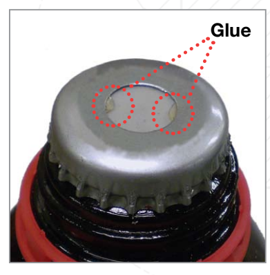
Glued septum invites contaminants

See back for the list of commonly used solvents available in the new and improved AcroSeal packaging.